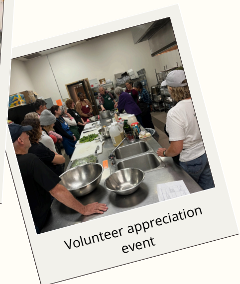
Volunteer appreciation event

Interested in volunteering with us? Find opportunities here: