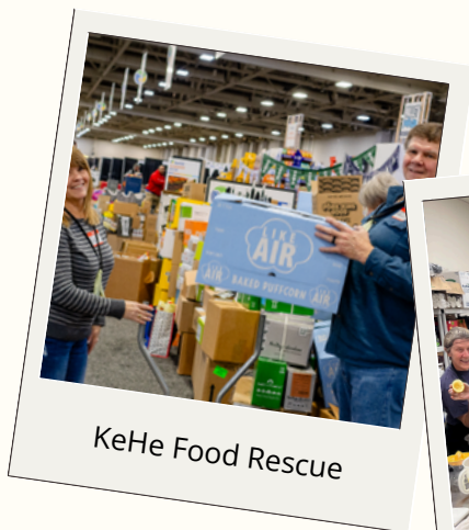
KeHe Food Rescue

Our volunteers are a critical element of our organization. Across all our programs, their dedication makes an enormous impact in our community!