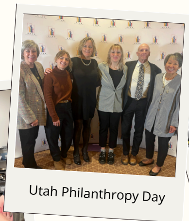
Utah Philanthropy Day