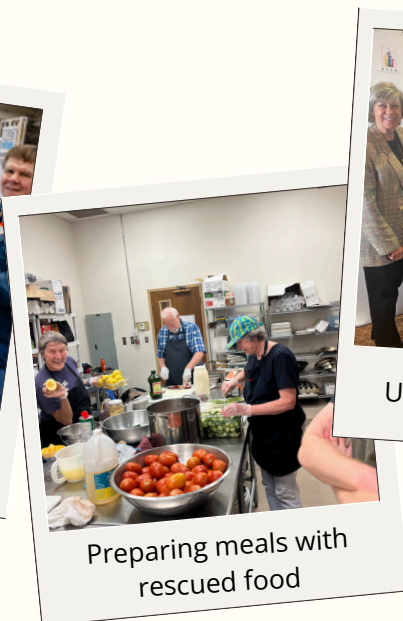
Preparing meals with rescued food